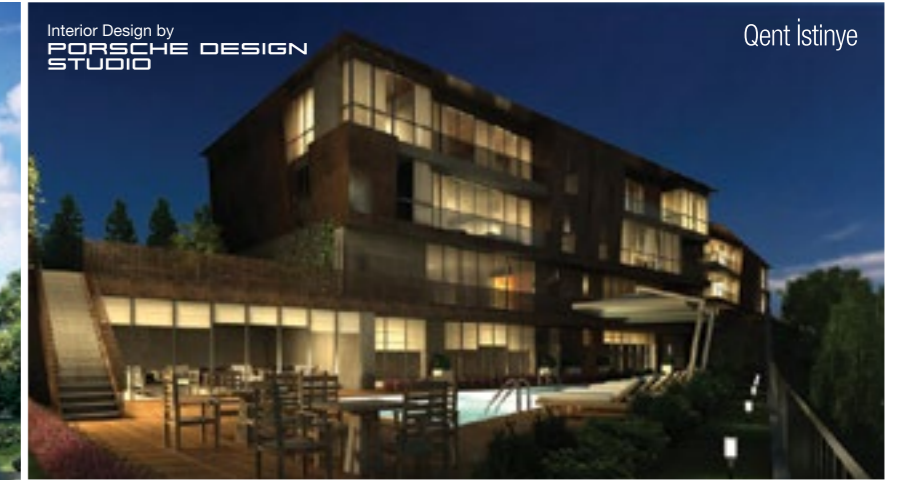
Interior Design by PORSCHE DESIGN STUDIO