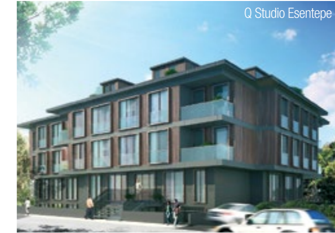
Q Studio Esentepe